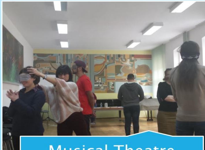
Musical Theatre Composition