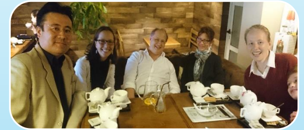
After the Lecture